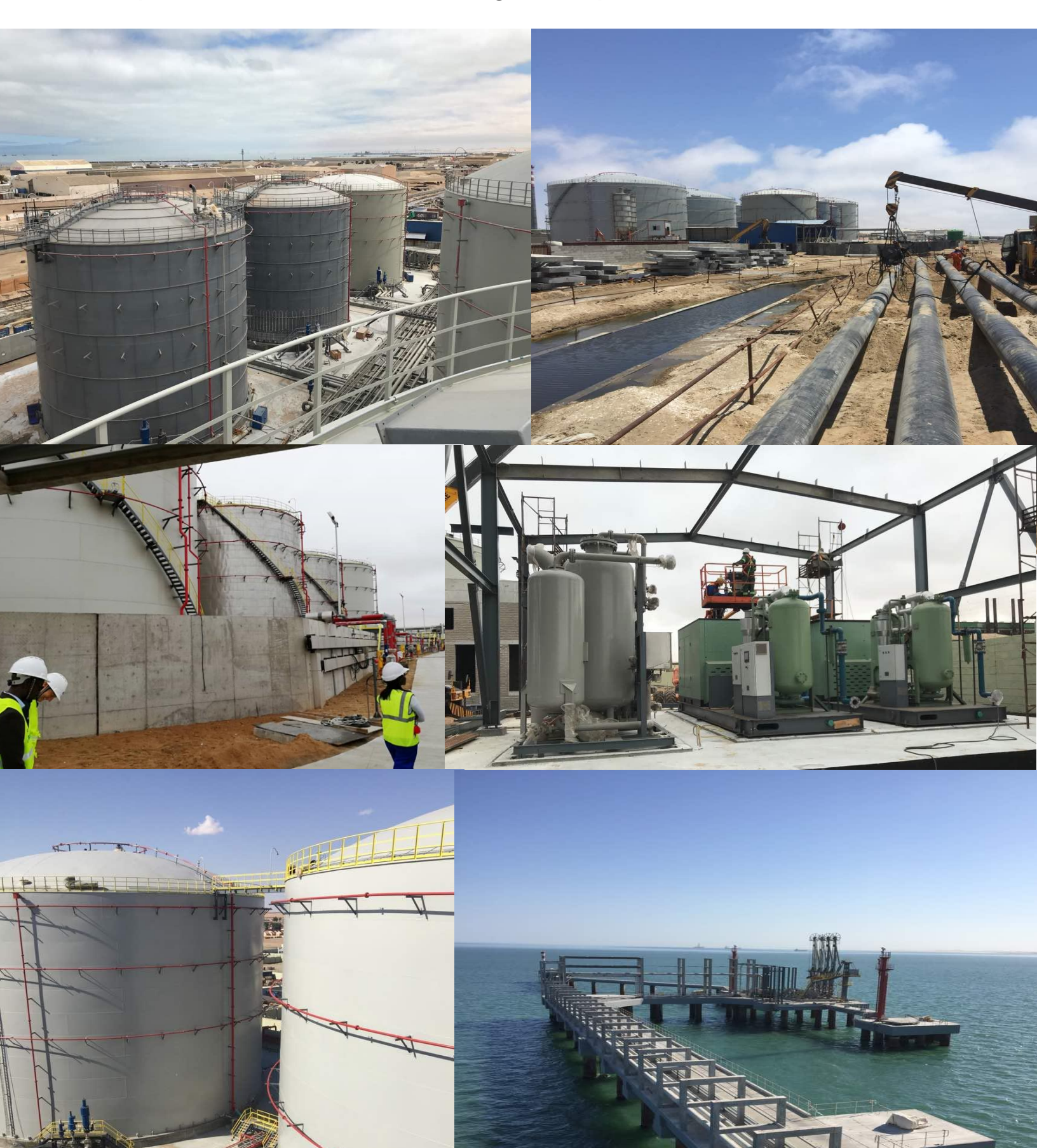
<u>Update</u> on the National Oil Storage Facility